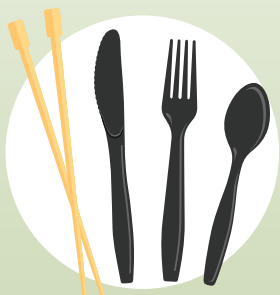
Knives, forks, spoons, chopsticks