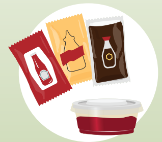
Sauce or condiment packets, sachets, or containers

To request an ADA accommodation, contact Ecology by phone at (360) 742-9874 or email at bagban@ecy.wa.gov , or visit https://ecology.wa.gov/accessibility .